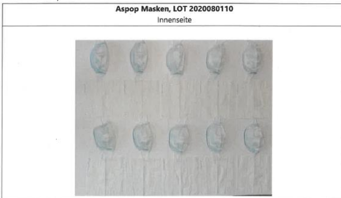
Bild Druck des Spritzwiderstandes

Tabelle 2: Resultate Druck des Spritzwiderstandes. Messergebnisse, welche nicht den Anforderungen entsprechen, sind gelb markiert.